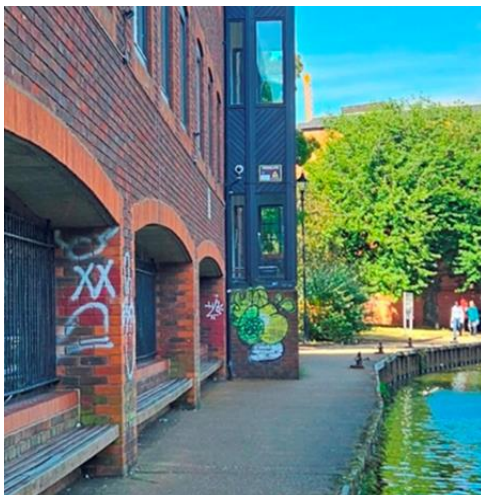
Photo before removal